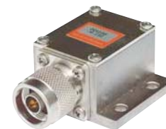
SMA OR N CONNECTORS 150, 250 & 500 WATTS

KEY: Inches [Millimeters] .XX ±.03 .XXX ±.010 LX ±0.8 .XX ±0.25J