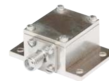
SMA 50 & 100 WATTS