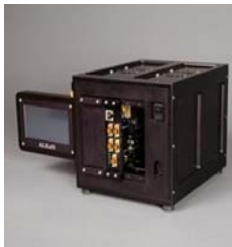
Figure 1: ALEXIS