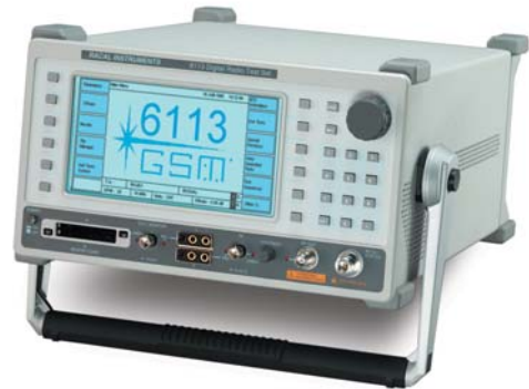
6113 Digital Radio Test Set

Test Sequence mode allows the user to run a complete sequence of single tests using only one or two keystrokes, allowing controlled and repeatable testing.